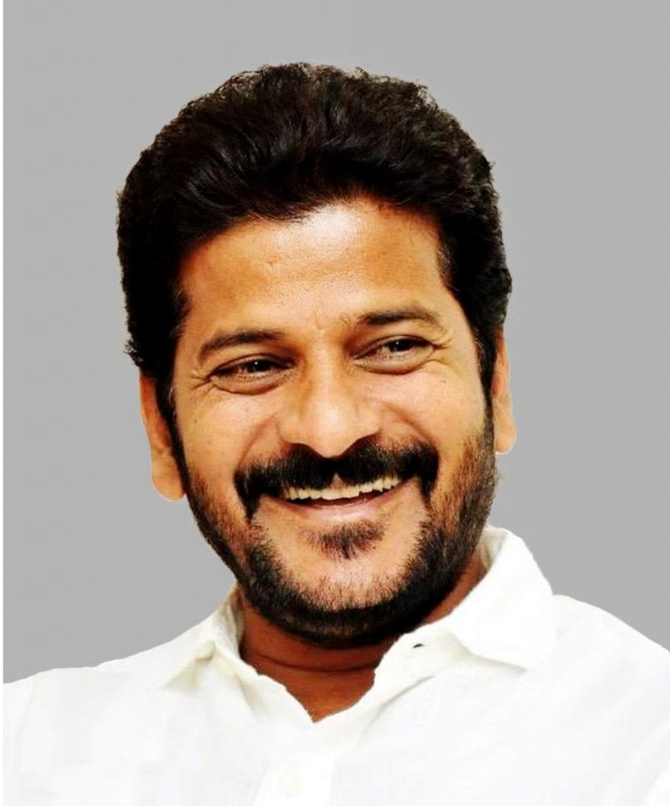
Sri A. REVANTH REDDY GARU Hon'ble Chief Minister of Telangana